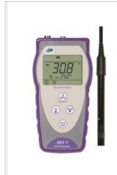
Housing for oxygen meter