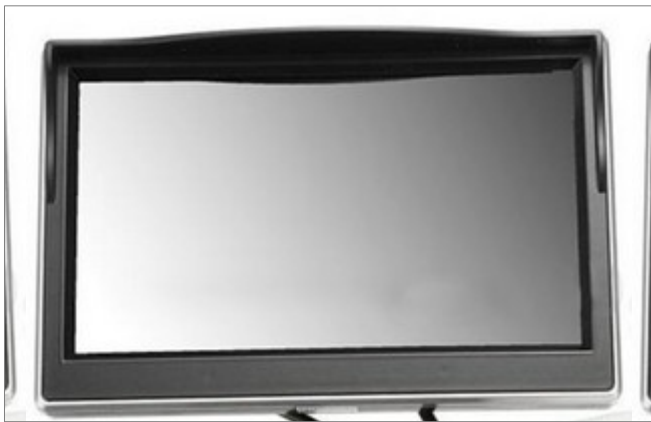
Screen for GPS navigation system in the car