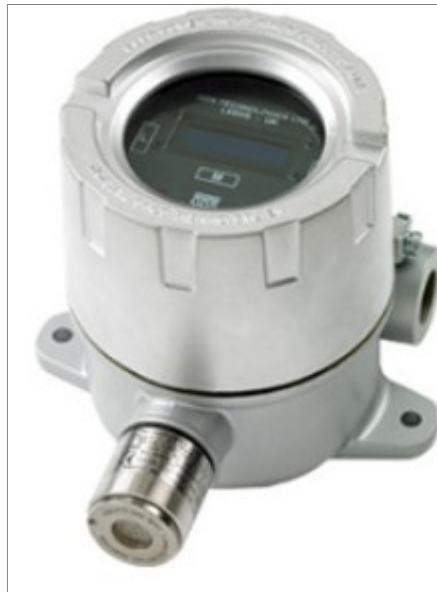
Stationary gas warning systems