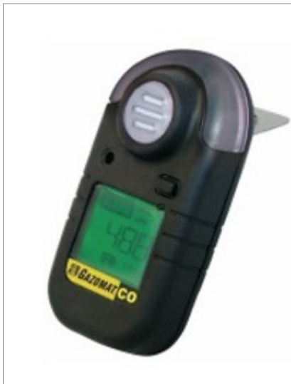
Portable gas detectors