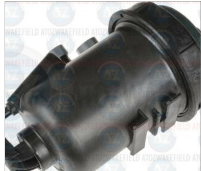
Housing for petrol filter