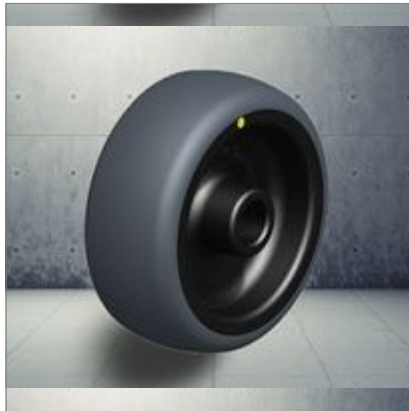
Castors for office chairs